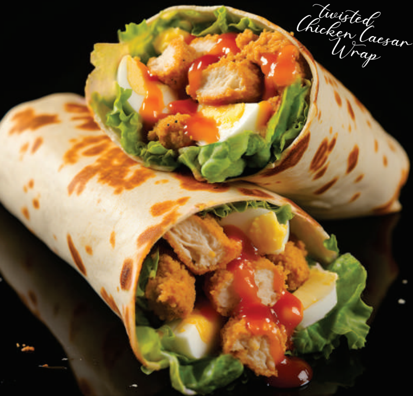
Twisted Chicken Caesar Wrap

All Handhelds & Favourites Include Your Choice of Side.