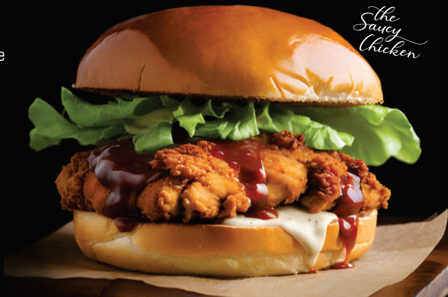
The Saucy Chicken

2 jumbo chicken tenders with lettuce, mayo and your choice of Wacky Flavour on a toasted bun. 17.49