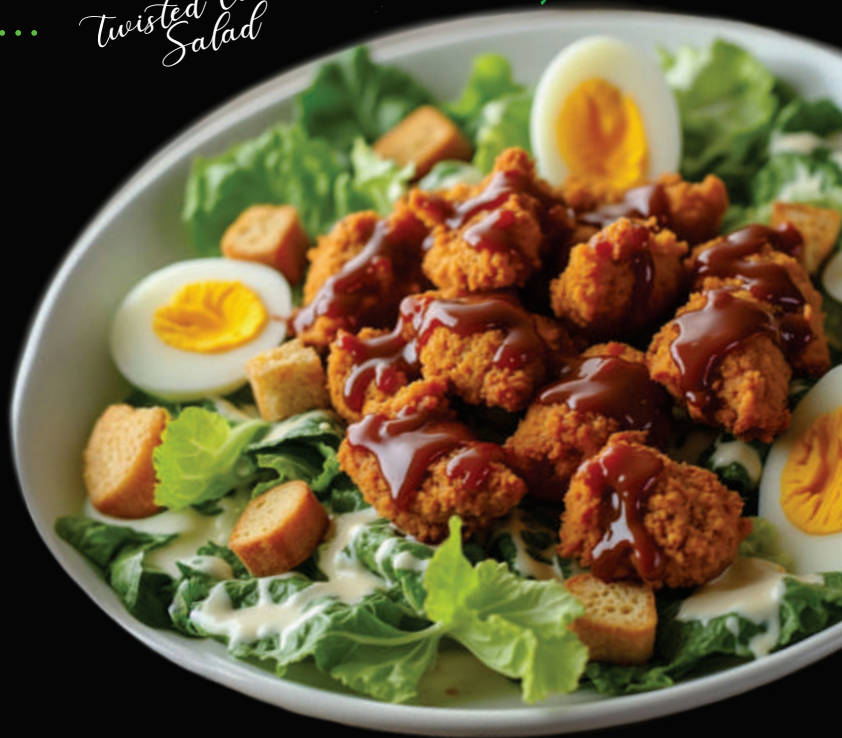
Twisted Caesar Salad