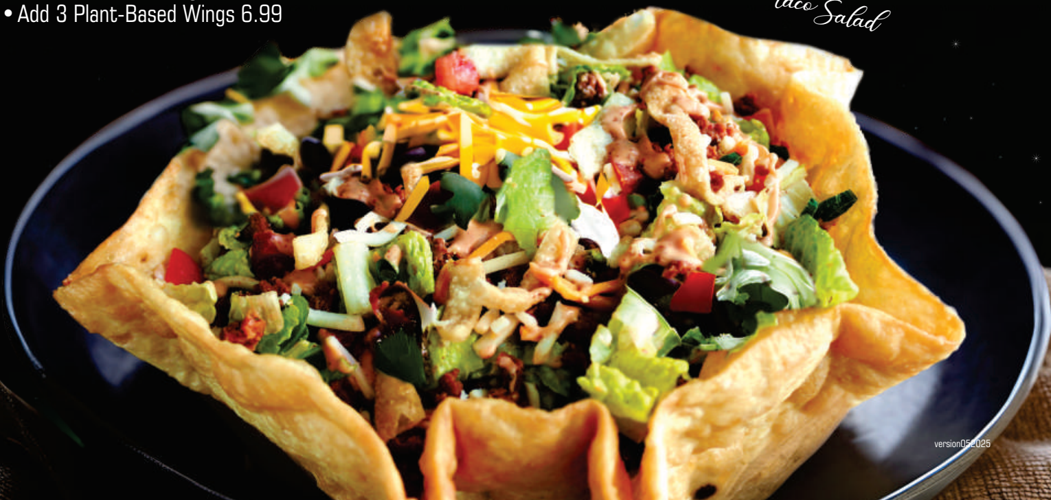
Southwest Taco Salad

Romaine lettuce, boneless wings with your choice of Wacky Flavour, hard-boiled egg, Parmesan cheese, croutons and Caesar dressing. 11.99/18.99