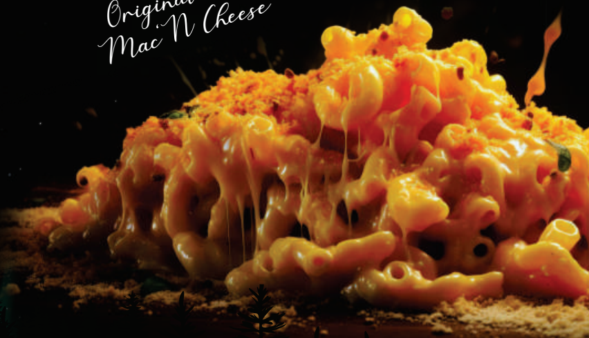
Original Mac 'N' Cheese

Our original Mac 'N' Cheese topped with boneless wings with your choice of Wacky Flavour, green onions, and garlic Parmesan drizzle. 15.99 Add garlic bread for 2.99