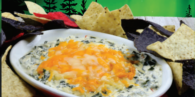
4-Cheese Spinach Dip