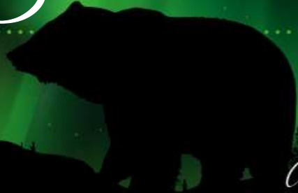
Cactus Cut Nachos