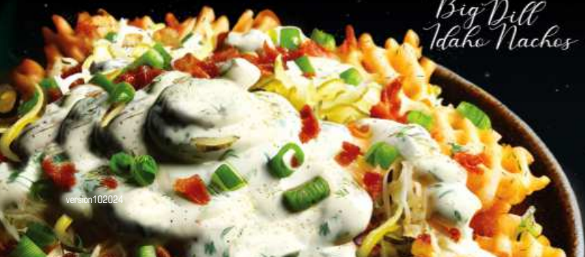
Big Dill Idaho Nachos

Flatbread topped with house-made bruschetta, feta cheese and balsamic glaze drizzle. 12.99