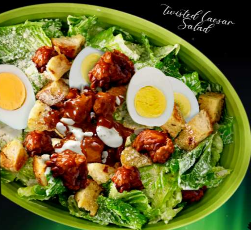
Twisted Caesar Salad

Made with a unique blend of seasonings and braised onions, then baked to perfection with Monterey Jack and Parmesan cheese. 8.99