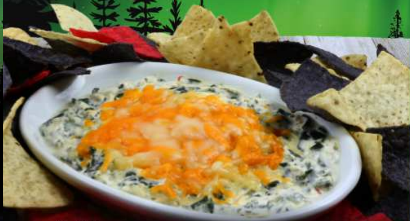
4-Cheese Spinach Dip