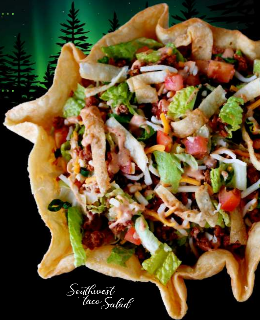
Southwest Taco Salad

Romaine lettuce, boneless chicken wings tossed in sauce of choice, hard-boiled egg, Parmesan cheese, croutons and Caesar dressing. 11.99/18.99